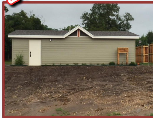
Restrooms near Splash Pad at Fisherman's park