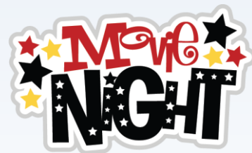
Below: Movies on the Riverwalk at Neighbor's Kitchen & Yard